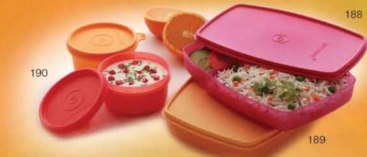
190 Tropical Twins (Set of 2) 250 ml each, ₹ 250/-