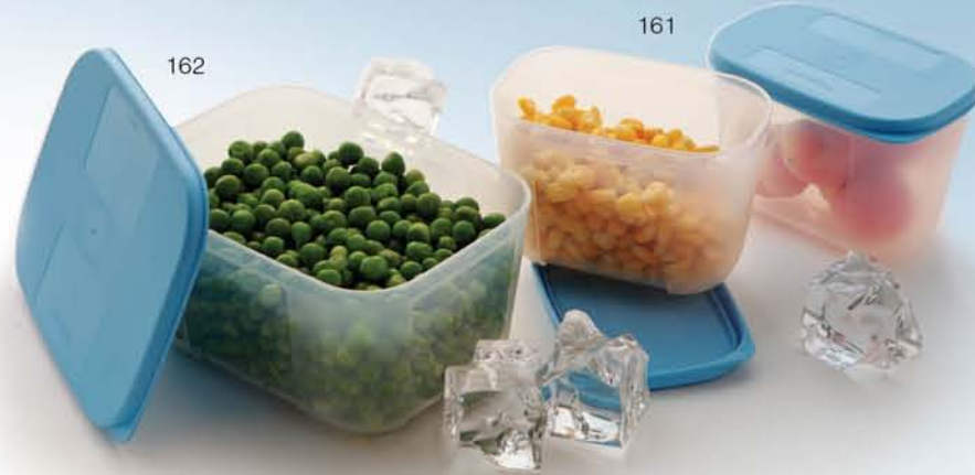
161 Freezer Mate Mini (Set of 2) 300 ml. each ₹ 295/- 162 Freezer Mate Small 700 ml. ₹ 315/-