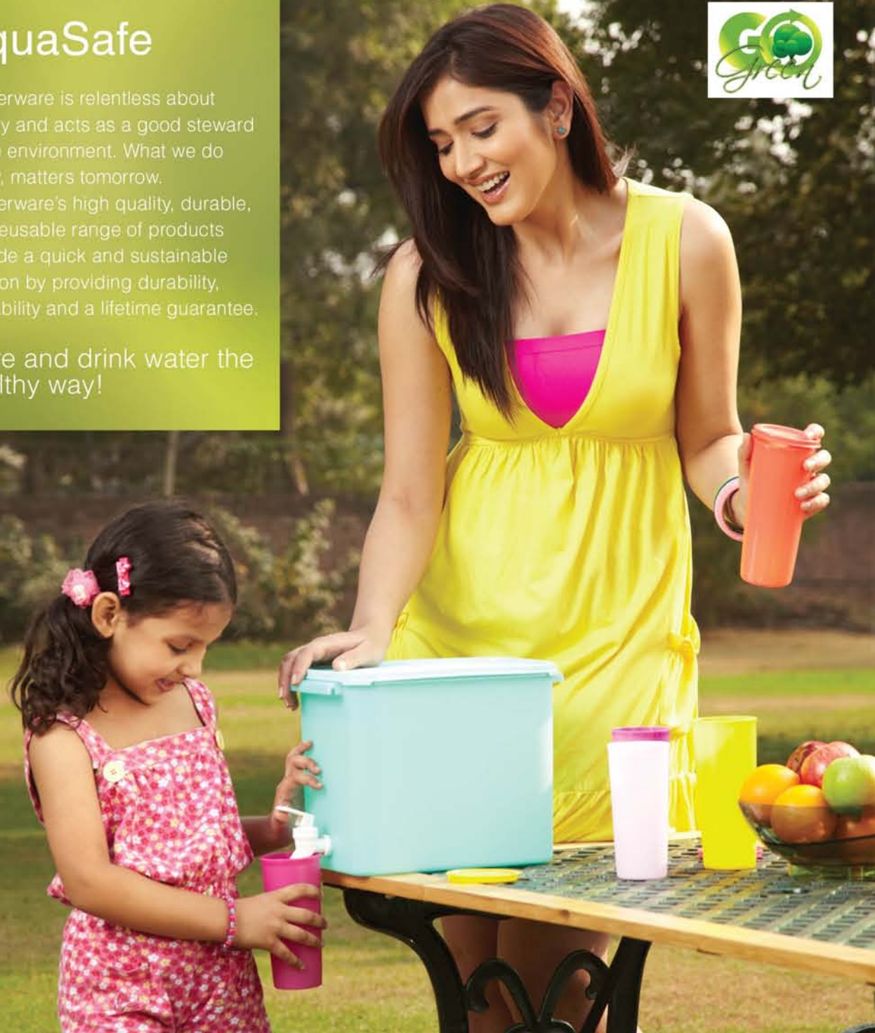
213 Water Dispenser 8.7 ltr. ₹ 1025/-