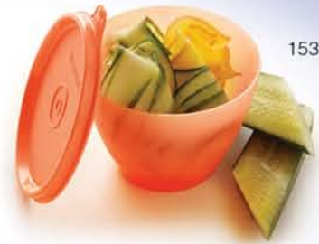
153 Bowled Over* 450 ml ₹ 115/-