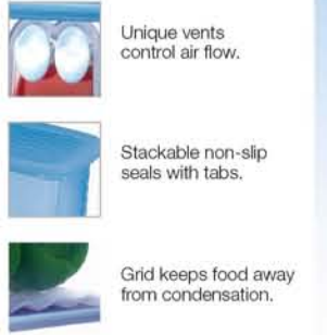
Unique vents control air flow.

FridgeSmart range has a unique venting system to regulate the amount of air flowing through the container. This ensures fruits and vegetables have the perfect environment to stay fresh.