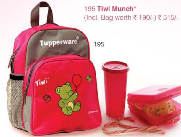
195 Tiwi Munch* (Incl. Bag worth ₹ 190/-) ₹ 515/-