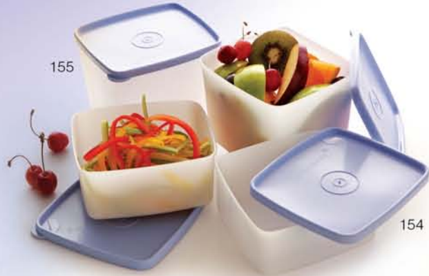
154 Cool 'n' Fresh Small (Set of 2), 450 ml each ₹ 360/- 155 Cool 'n' Fresh Medium (Set of 2), 700 ml each ₹ 430/-