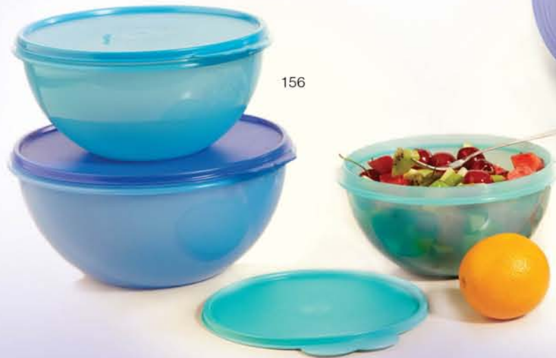
156 Wonderlier Bowl Set ₹ 1150/- Set Comprises: Small 1.4ltr., Medium 2ltr., Large 2.5ltr. (1 pc each)