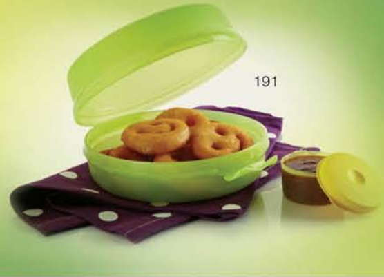
191 Round Sandwich Keeper ₹ 260/-