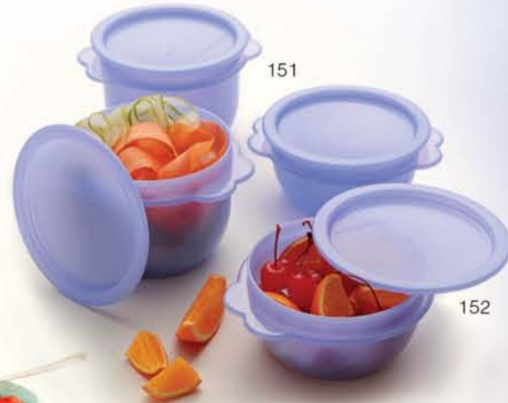
151 Star Bowls Small (Set of 2), 500 ml each ₹ 400/- 152 Star Bowls Large (Set of 2), 700 ml each ₹ 480/-

Tupperware's range of Refrigerator products help you transform a messy refrigerator into an organised one. You not only save space, but even money, since everything can be kept fresher for longer, while the refrigerator looks its very best.